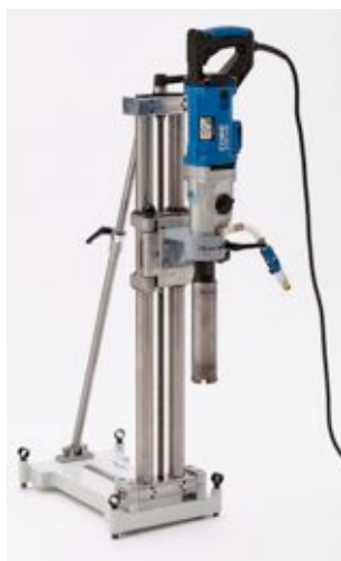
140 drill stand fitted with 2.2kW 3 speed electric drill motor & integral water swivel