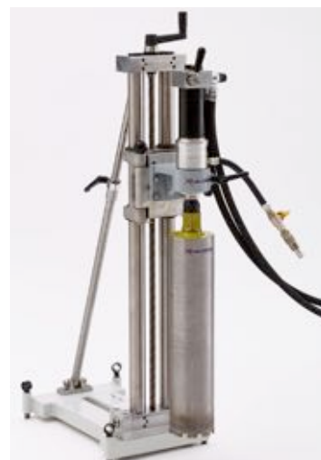
140 drill stand fitted with 4.0 kW hydraulic drill motor & integral water swivel